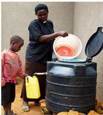
Slow Sand Filter System