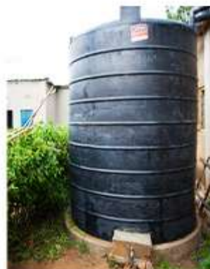
Rainwater Harvesting System